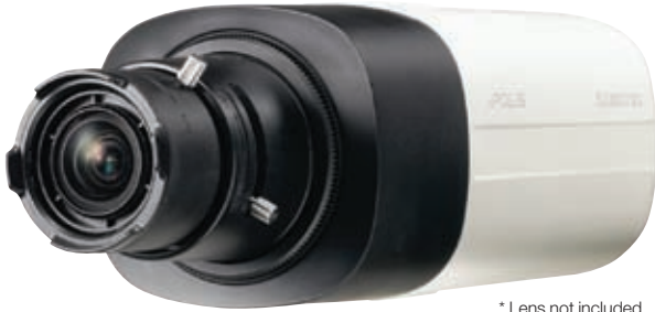
* Lens not included