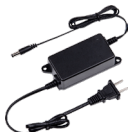
PFM320 12V 2A Power Adapter