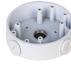
PFA139 Junction Box