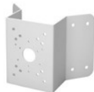
PFA151 Corner mount