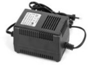
AC24V/3A Power Adapter