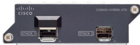
Figure 6. Cisco FlexStack-Extended: Hybrid module