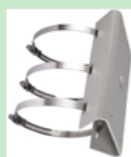
DS-1275ZJ Vertical pole mount