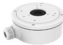
DS-1280ZJ-S Junction Box