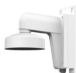
DS-1273ZJ-130B Wall Mount