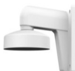
DS-1273ZJ-130 Wall Mount