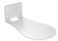
DS-1692ZJ Wall Mount Bracket