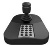
DS-1005KI USB Joy-stick