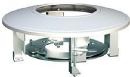
Indoor in-ceiling mount DS-1227ZJ