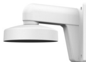
Indoor wall mount DS-1273ZJ-130