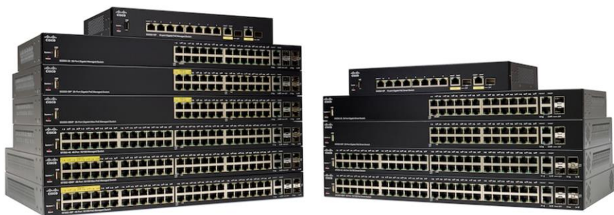
Figure 1. Cisco 250 Series Smart Switches

The Cisco 250 Series is the next generation of affordable smart switches that combine powerful network performance and reliability with a complete suite of the network features you need for a solid business network. These powerful Fast Ethernet or Gigabit Ethernet switches, with Gigabit or 10 Gigabit Ethernet uplinks, provide multiple management options, sophisticated security capabilities, fine-tuned Quality-of-Service (QoS) and Layer 3 static routing features far beyond those of an unmanaged or consumer-grade switch, at a lower cost than for fully managed switches. And with an easy-to-use web user interface, Smart Network Application, and Power over Ethernet Plus (PoE+) capability, you can deploy and configure a complete business network in minutes.