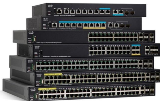
Figure 1. Cisco 350X Series Stackable Managed Switches

Cisco 350X Series switches are designed to protect your technology investment as your business grows. Unlike switches that claim to be stackable but have elements that are administered and troubleshot separately, the Cisco 350X Series provides true stacking capability, allowing you to configure, manage, and troubleshoot multiple physical switches as a single device and more easily expand your network.