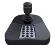
DS-1005KI USB Joy-stick