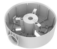
DS-1280ZJ-PT3 Junction box