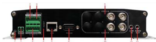
Rear Panel of DS-6604HFI