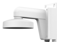
DS-1273ZJ-130B Wall Mount with junction box