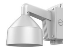
DS-1273ZJ-DM26-B Wall mount with junction box