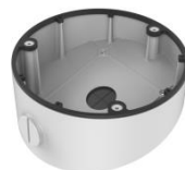
DS-1281ZJ-DM26 Inclined ceiling mount