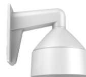
DS-1273ZJ-DM26 Wall mount