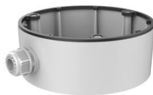
DS-1280ZJ-DM26 Junction box