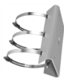
DS-1275ZJ Vertical pole mount