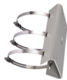
DS-1275ZJ Vertical pole mount